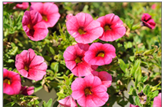
Colibri Malibu Pink Calibrachoa flowers