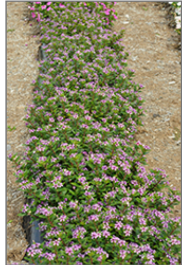
Soiree Kawaii Blueberry Kiss Vinca in bloom

Soiree Kawaii Blueberry Kiss Vinca is a fine choice for the garden, but it is also a good selection for planting in outdoor containers and hanging baskets. Because of its trailing habit of growth, it is ideally suited for use as a 'spiller' in the 'spiller-thriller-filler' container combination; plant it near the edges where it can spill gracefully over the pot. Note that when growing plants in outdoor containers and baskets, they may require more frequent waterings than they would in the yard or garden.