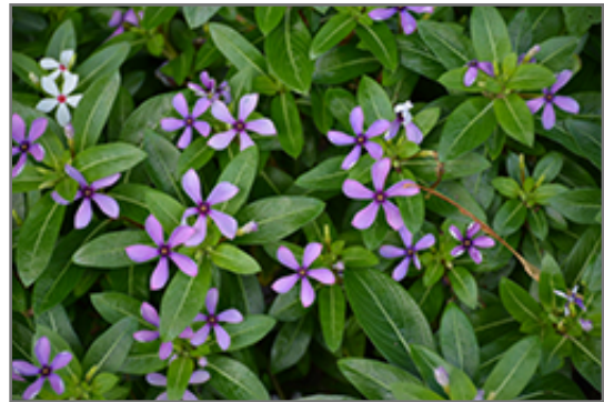
Soiree Kawaii Blueberry Kiss Vinca flowers