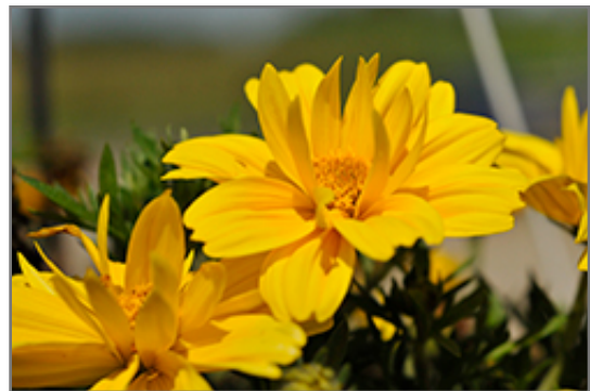
Sun Drop Double Yellow Bidens flowers