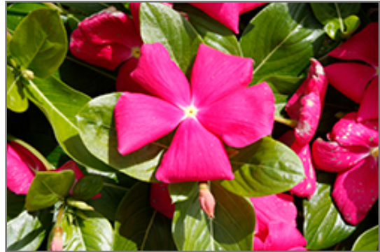
Cora Cascade Bright Rose Vinca flowers

Cora Cascade Bright Rose Vinca is recommended for the following landscape applications;