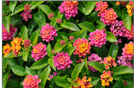
Bloomify Rose Lantana flowers

Bloomify Rose Lantana is recommended for the following landscape applications;