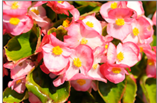
Super Cool Blush Begonia flowers

Super Cool Blush Begonia is recommended for the following landscape applications;