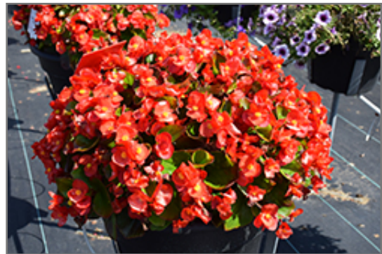
Super Cool Red Begonia in bloom