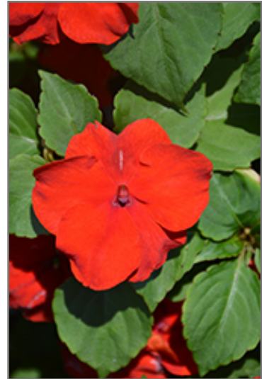
Xtreme Red Impatiens flowers