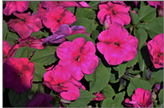
Xtreme Violet Impatiens flowers