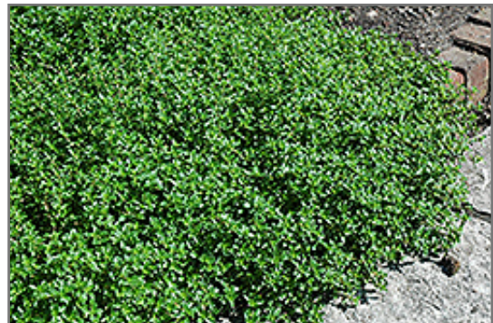
Spanish Thyme