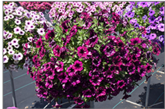
Splash Dance Magenta Mambo Petunia in bloom