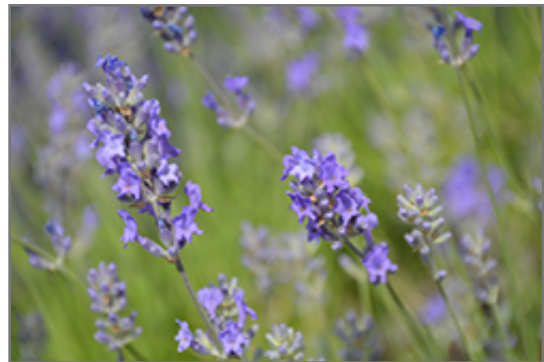
Sachet Lavender flowers