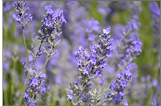
Sachet Lavender flowers

Sachet Lavender is recommended for the following landscape applications;