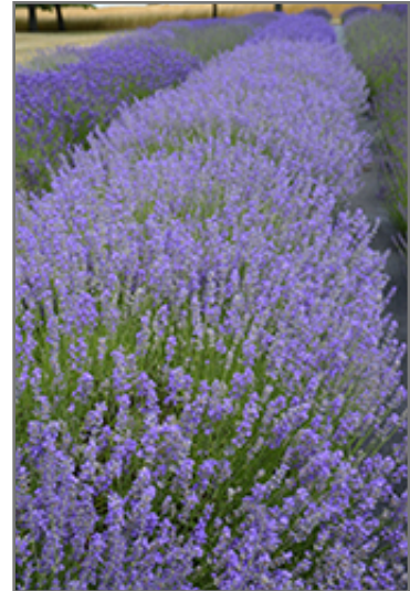
W.K. Doyle Lavender in bloom