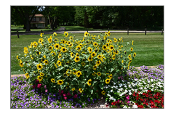
Sunfinity Sunflower in bloom

This plant should only be grown in full sunlight. It does best in average to evenly moist conditions, but will not tolerate standing water. It is not particular as to soil type or pH. It is highly tolerant of urban pollution and will even thrive in inner city environments. This particular variety is an interspecific hybrid.