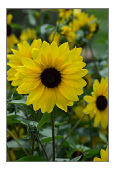
Sunfinity Sunflower flowers