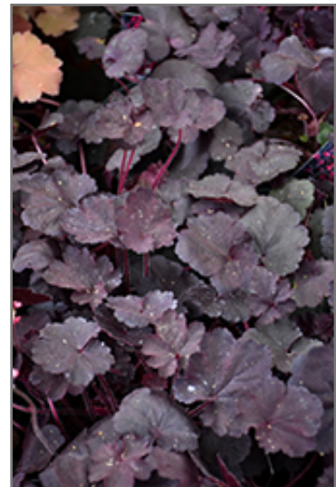
Black Forest Cake Coral Bells foliage