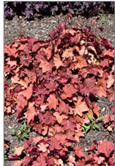
Carnival Cinnamon Stick Coral Bells