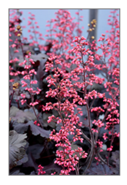
Timeless Night Coral Bells flowers