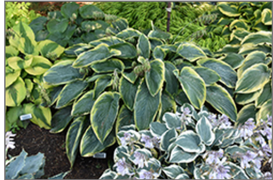
Shadowland Wu-La-La Hosta

Shadowland Wu-La-La Hosta is recommended for the following landscape applications;