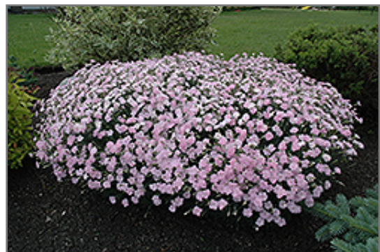
Mountain Mist Pinks in bloom