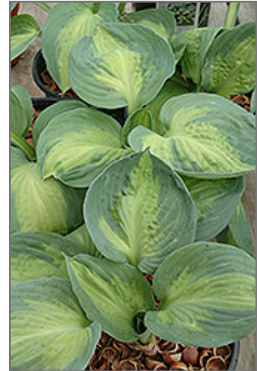
Adrian's Glory Hosta foliage