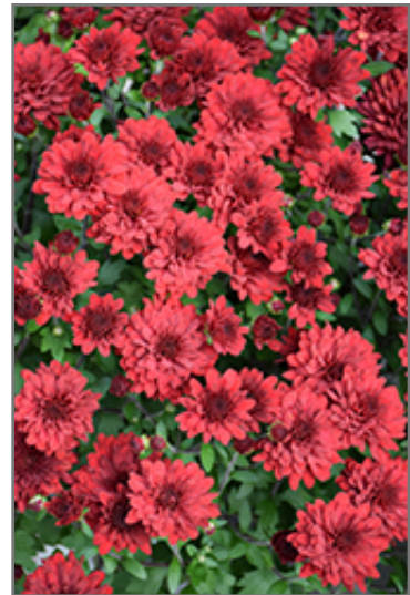
Five Alarm Red Chrysanthemum flowers