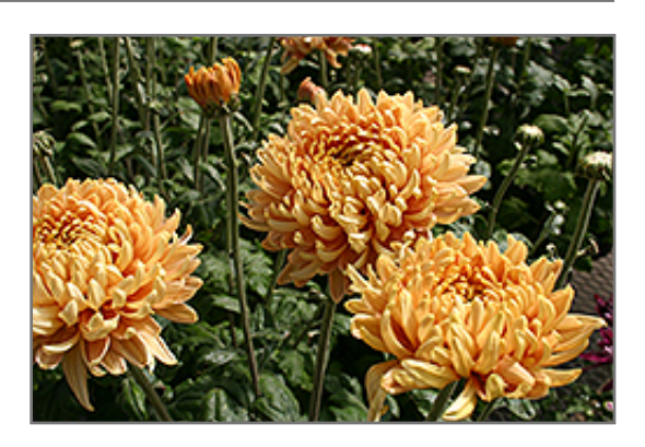
Homecoming Chrysanthemum flowers

Showy, double, salmon-pink, football mum; flowers cover a mound of strong, flexible stems; blooms late in the season; adaptable to various conditions; best in full sun