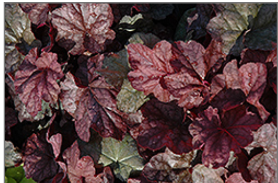
Beaujolais Hairy Alumroot foliage