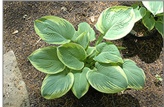
Robert Frost Hosta