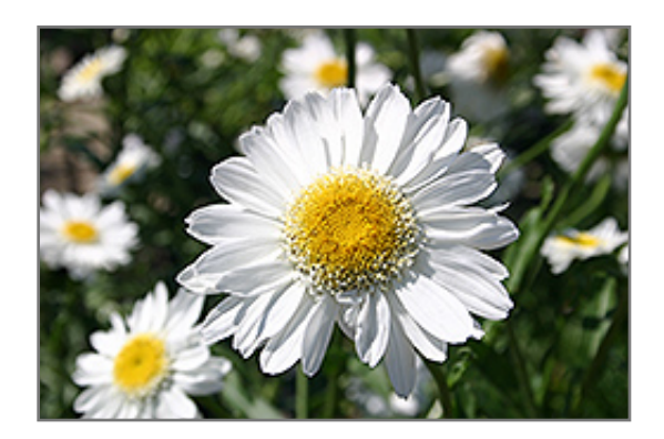
Sunny Side Up Shasta Daisy flowers