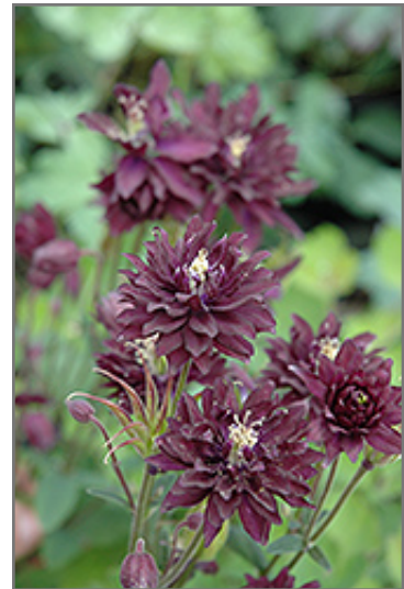
Clementine Dark Purple Columbine flowers