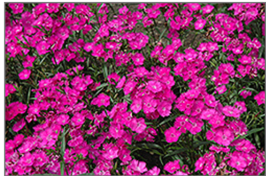
Bouquet Purple Pinks in bloom