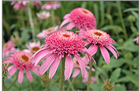
Cone-fections Pink Double Delight Coneflower flowers