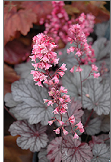
Milan Coral Bells flowers