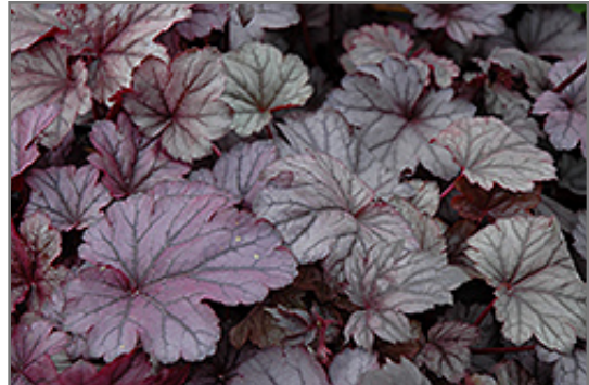
Shanghai Coral Bells foliage