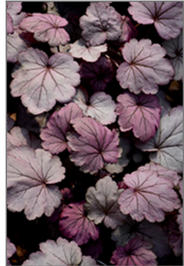
Sugar Plum Coral Bells foliage

Sugar Plum Coral Bells is recommended for the following landscape applications;