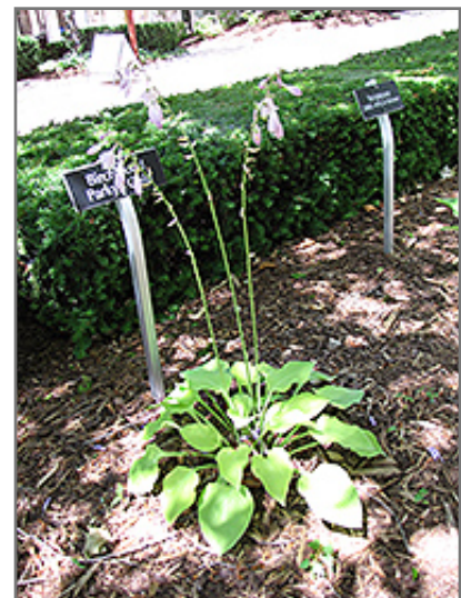
Birchwood Parky's Gold Hosta in bloom