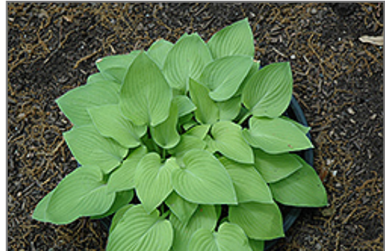
Birchwood Parky's Gold Hosta

Birchwood Parky's Gold Hosta is recommended for the following landscape applications;