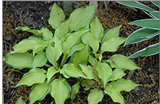
Cracker Crumbs Hosta