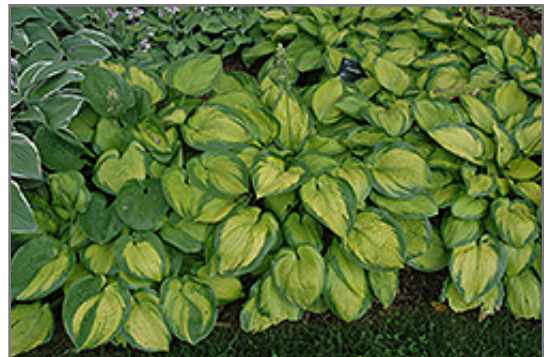
Paradigm Hosta