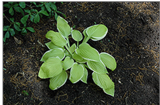
St. Elmo's Fire Hosta