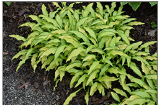
Kabitan Hosta