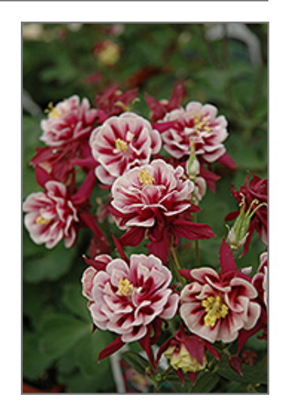
Double Red And White Columbine flowers